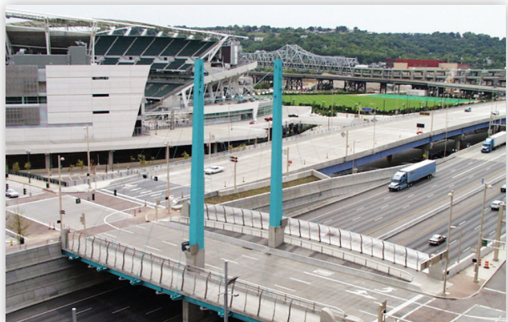
The case study series also features a highway depression project in Cincinnati, Ohio.