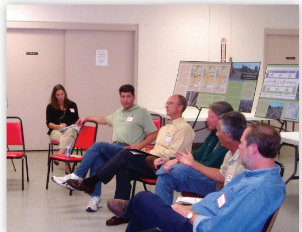
The focus group meetings yielded valuable information about emerging community principles and values.