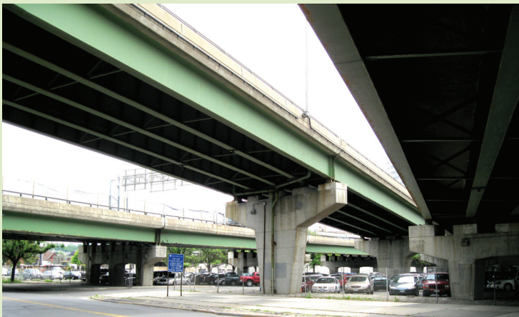
The bridges in the aging I-81 viaduct are nearly 50 years old.

I-81 was built in Onondaga County in the 1950s and 1960s. This means that portions of I-81 are nearing the end of their intended lifespan. In particular, it is the deteriorating condition of the 1.4-mile elevated section of the interstate in the City of Syracuse (the viaduct) that is the primary motivation for studying the future of I-81 at this time. It will take years to reach a decision about the future of the highway so it is important to start the process now.