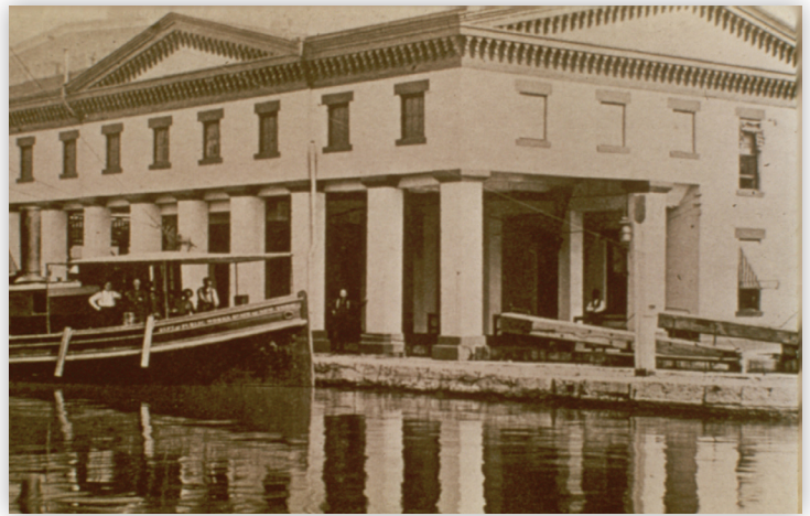
Watch the I-81 video series to learn how the canals and railways of the past impacted our modern transportation system.

We hope you'll enjoy learning more about The I-81 Challenge . You can view the presentations at www.thei81challenge.org/edseries .