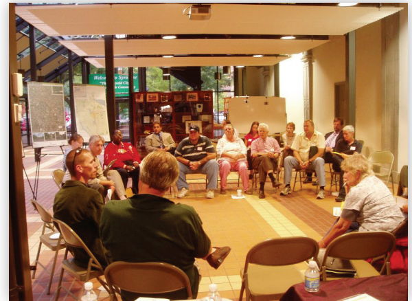
Focus group meetings were held between Fall 2009 - Spring 2010.

What do you think of these emerging community principles? Is anything missing? Help us refine this list by participating in The I-81 Challenge Public Workshops on May 3, 4, & 7, 2011. See page 5 for more details.