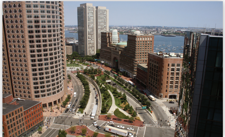
The case study video series covers several projects including Boston's "Big Dig."