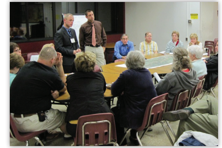
Public participation is an integral part of The I-81 Challenge.

We look forward to hearing from you in the coming months!