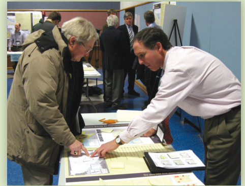
Public participation is key in determining the future of I-81.

As a community member, you can impact this process in several important ways. First, you can educate yourself about the highway and the process by regularly visiting www.theI81challenge.org , signing up for our mailing list, and participating in public involvement opportunities as they arise. (See “Be Part of The I-81 Challenge ” on page 2.) Your input will help guide the development of options for the future of the highway. Just as importantly, your input will help inform the criteria that will be used to narrow down potential options for the future of the highway.