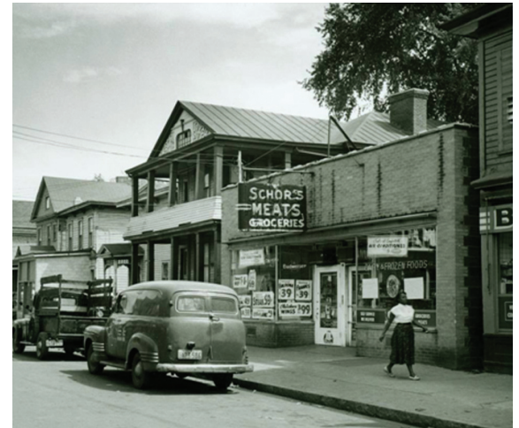
"The History" part of the series covers I-81's impact on Syracuse's 15th Ward.

The final decisions about I-81 are still years away, but discussions about our future are happening now. "Blueprint: The Rt. 81 Corridor" is a must see for anyone in the Syracuse region. All three episodes of "Blueprint: The Rt. 81 Corridor" are available on