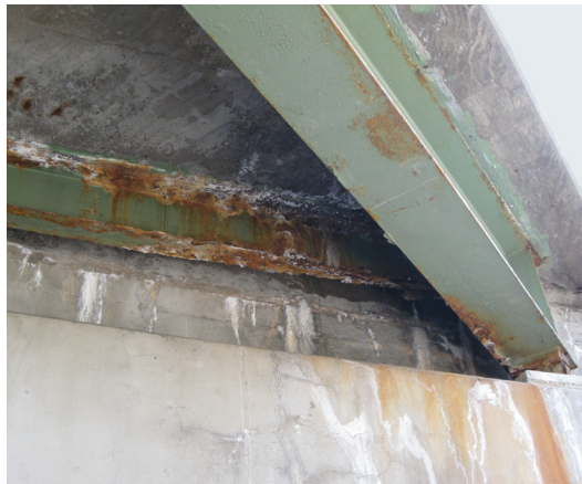
"The Plan" segment of the series addresses safety and maintenance issues on I-81.

In the final installment of the program, "The People Speak," two community leaders spoke about their ideas for the future, from "living with the highway" to taking it down and replacing it with a pedestrian-friendly boulevard. The episode explored alternatives from other cities and elaborated on the solutions already being advocated by community groups in the region.